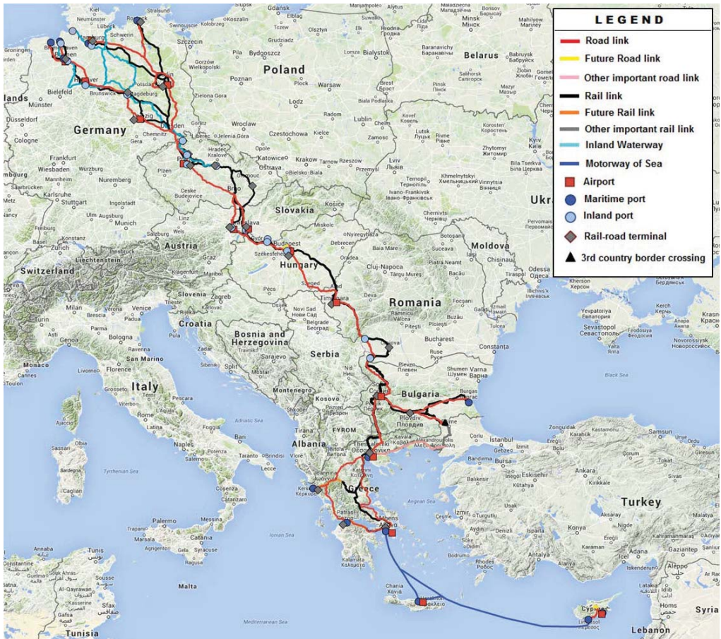
Fig.1: The OEM TEN-T Core Network Corridor, alignment and nodes

original designation as one of the priority projects, and then the modification in 2012 under the name Orient/East-Med (OEM) Corridor (Corridor No. 3 of the nine TEN-T core network corridors).