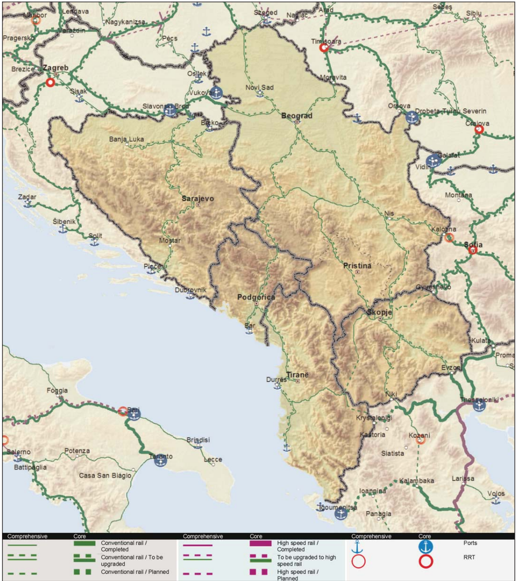
Fig. 3: Indicative extension of the TEN-T Comprehensive Rail Network for the Western Balkans region published in Regulation 2013/1315/EU

On EU territory, the Commission has given its backing to a study to assess the need for a rail link between Budapest and Athens via Timisoara (RO)–Calafat (RO)–Vidin (BG)–Thessaloniki (GR). Currently this link is not fully operational and support is needed to develop the link to the necessary extent.