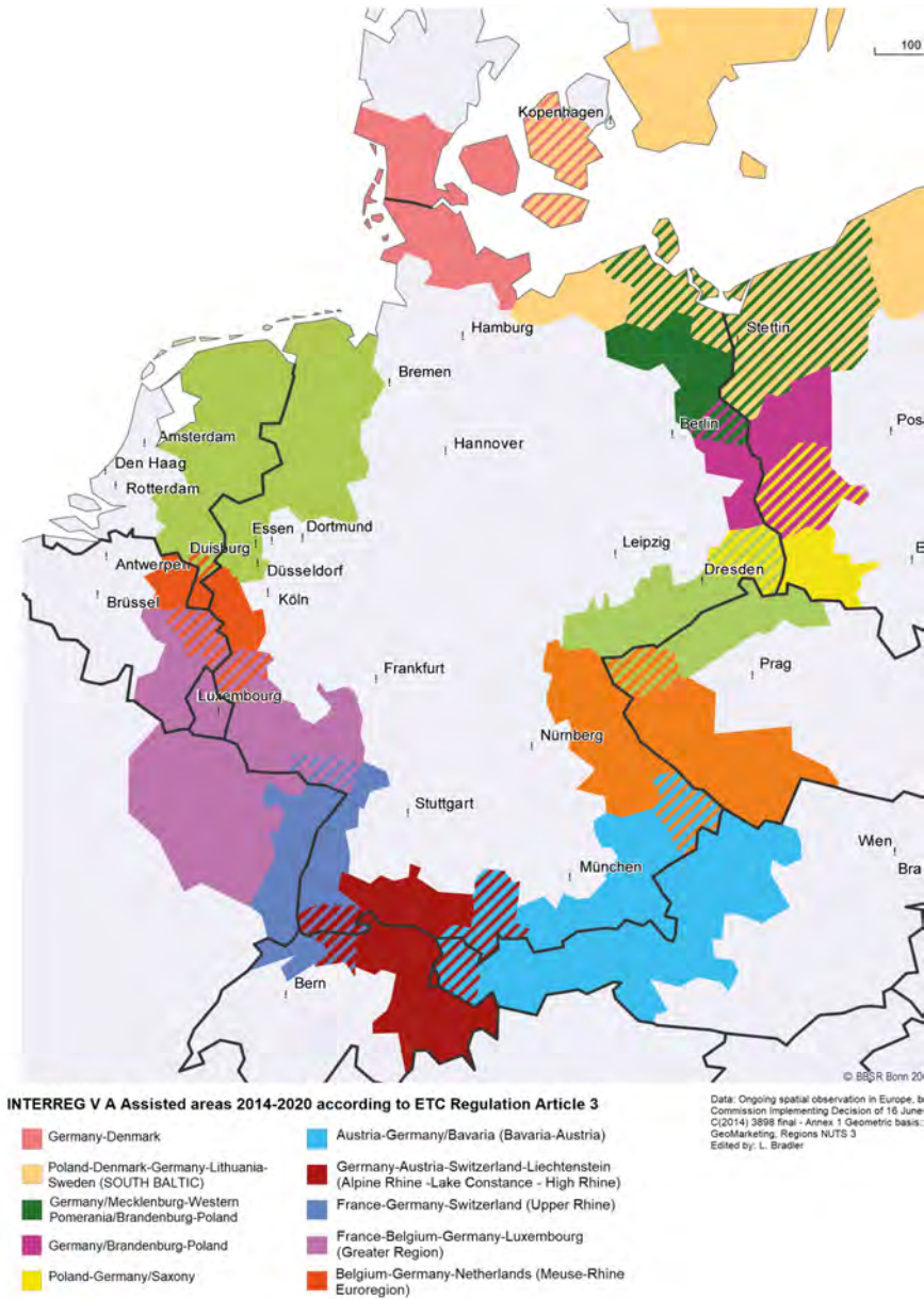
Fig. 2: INTERREG V A (cross-border cooperation) – German participation 3