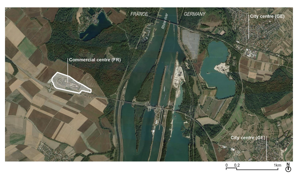
Figure 3 A shopping centre built on the French side of the border on agricultural land (left of the picture) is now competing with the town centre shops of small German municipalities (right side) which had blocked any such facilities from setting up on the urban outskirts

Wallonia, where the constraints are less severe. Hence, in the cities of Mouscron or Estaimpuis, the vast majority of requests received for business parks come from Flemish companies. This phenomenon has multiple consequences, including the division now emerging between companies capable of paying the price to set up on the few remaining plots of land in Flanders and the others that set up in Wallonia. Other consequences include increased commuting flows and the need for additional transport infrastructures in a functional area that cuts across regional~borders.