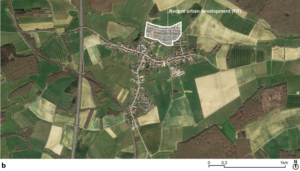
Figure 2 A new neighbourhood, built on agricultural land, in a small French commune bordering Luxembourg

ZAN. One reason for this is that elected officials tend to prioritise the preservation of the living environment and/or urban services. For example, in an intermunicipal area bordering the Lille metropolitan area "Métropole Européenne de Lille", where 70% of the working population works outside of the intermunicipal area, elected officials are absolutely determined to welcome new inhabitants in order to keep the local school open. The school is considered to be a key site of sociability and the driving force behind community networks. In Lorraine, the small size of Zoufftgen (a municipality with a population of 1,200; population doubled from 600 to 1.200 inhabitants between 2006 and 2016) has not stopped local elected officials from mobilising a range of land-control instruments. Elected officials wanted to attract young households at all costs. To this end, they bought land before it was declared buildable, carried out the servicing work themselves and welcomed people interested in buying a plot in order to select those who wanted