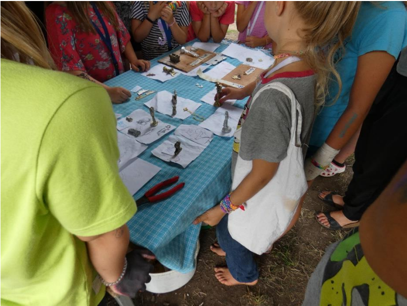
Collaboration with children’s summer camp and artists’ residence at youthwork