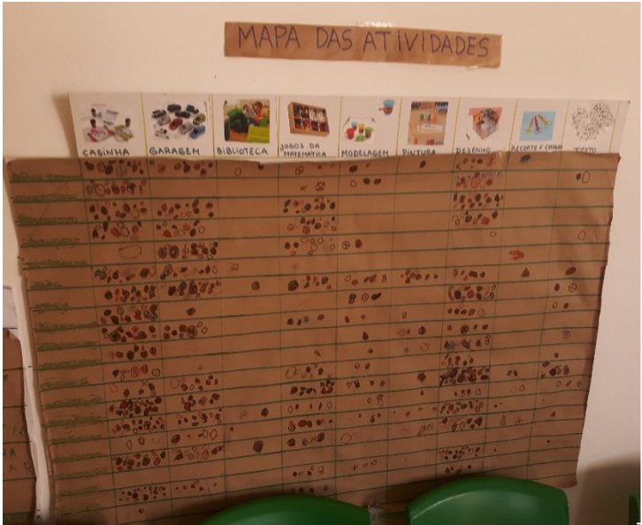
Guiding children to make decisions and keeping them as part of the daily routine, Daycare