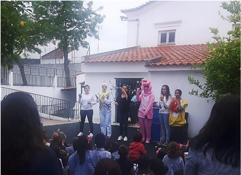
Mother’s day Event at Daycare